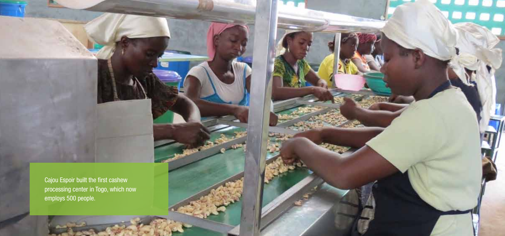
Cajou Espoir built the first cashew processing center in Togo, which now employs 500 people.