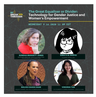
Download Image Here

Tune in 9/16 1 11am http://bit.ly/RFBreakthroughig