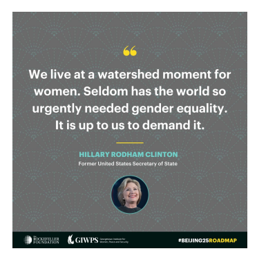
Download Image Here