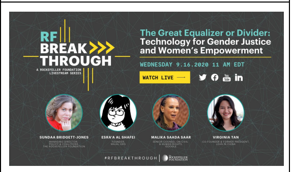
Download Image Here

Post the question sourcing graphic between September 10-14 by 5 pm ET.