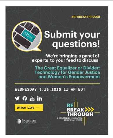
Download Image Here

When you hear the phrase "gender equity", are you left with questions regarding how, who, and when? 1 Submit a question to our expert panelists 2 Tune in to the #RFBreakthrough conversation on #Beijing25Roadmap for their answers. 9/16, 11 AM ET: <a href="http://bit.ly/RFBreakthroughfb">http://bit.ly/RFBreakthroughfb</a>