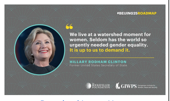
<u>Download Image Here</u>

NEW: Bold recommendations to accelerate progress for women & girls, drafted by @giwps @RockefellerFdn & @HillaryClinton along w/ 25 former presidents, foreign ministers & activists. #Beijing25Roadmap—The road to gender equality involves all of us: http://bit.ly/Beijing25Roadmap