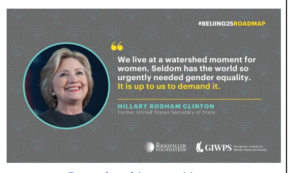
Download Image Here