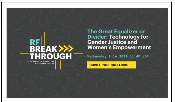
Download Image Here

9/16 | 11am ET: http://bit.ly/RFBreakthroughtw #RFBreakthrough