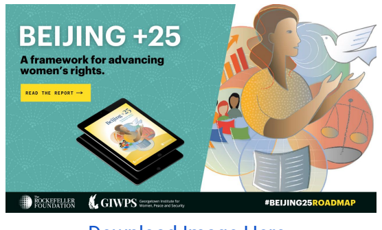
Download Image Here

Today we release the #Beijing25Roadmap. Relying on the wisdom of women from every sector, @giwps @RockefellerFdn & @HillaryClinton outline critical challenges facing women and offer strategies for the way forward: http://bit.ly/Beijing25Roadmap