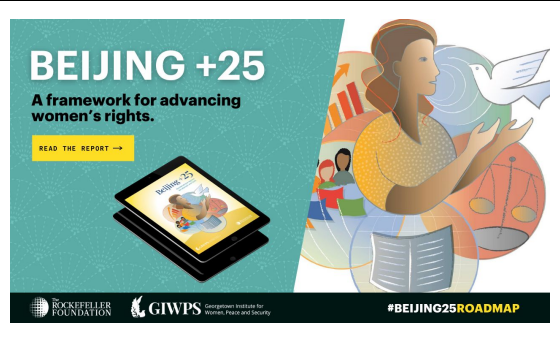
Download Image Here