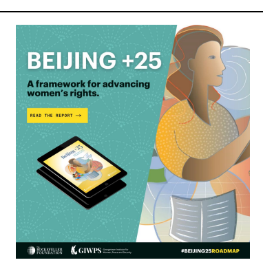
<u>Download Image Here</u>