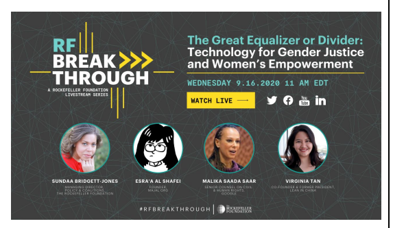
Download Image Here

9/16 111am ET: http://bit.ly/RFBreakthroughli #RFBreakthrough