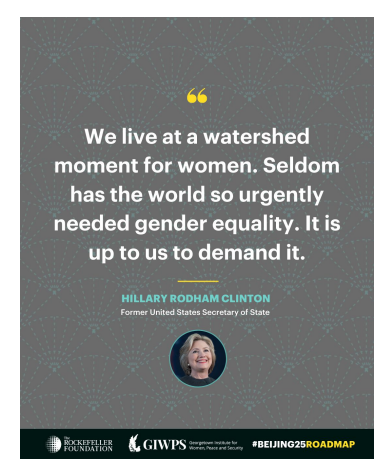
Download Image Here

We must erase gender inequities that Covid-19 has so vividly and irrefutably, exposed. Today, @giwps @RockefellerFoundation & @HillaryClinton present a roadmap to finally overcome obstacles to gender equality. Take a look # http://bit.ly/Beijing25Roadmap_FB