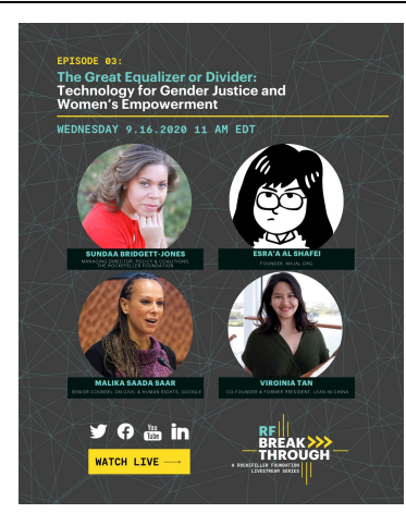
Download Image Here

Post the live-stream tune-in graphic between September 14-15 by 5 pm ET.