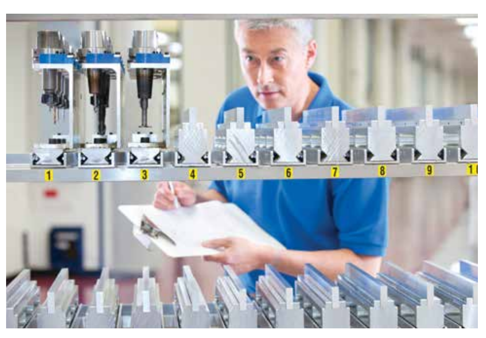
A Sustainable Path to a More Resilient Future

Through sound policymaking and commitment from both the public and private sectors, the world's leading manufacturing regions can begin a sustainable path to a more prosperous and resilient future, enabled by advanced manufacturing.