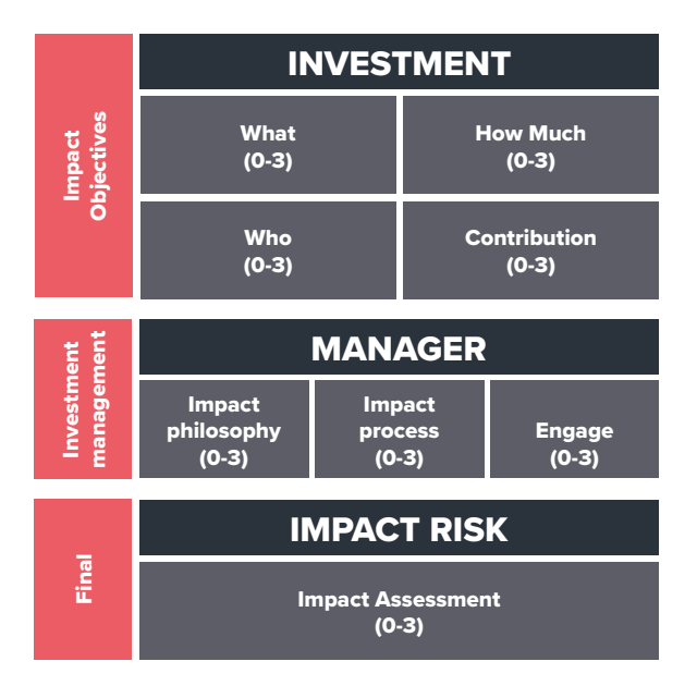
Figure 3 | Illustrating Snowball's in-house analysis framework: Snowball Impact Screens

The scoring system guides Snowball through a series of questions to determine whether the individual enterprise, or portfolio of enterprises, are likely to meet the performance thresholds for 'Contribute to Solutions' , as shown in Figure 2.