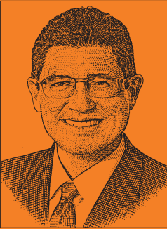
Secretary of Finance, State of Rio de Janeiro, Brazil; plenary speaker

until 1960, Rio de Janeiro was the capital of Brazil. Once the capital moved to Brasília the city was left to its own devices. Also the military clamped down on the local liberal elite until the late 1970s. Unsurprisingly, the state became rife with parochial politics and has served mainly as a springboard for ambitious politicians running for president. So, although from time to time people offered good plans for the city, we had no one to implement them.