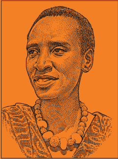
Executive Director, Pamoja Trust, Nairobi, Kenya

many see urban development as chaotic and uncontrolled. As loads of people move out of unsustainable rural settings into unplanned urban communities, they lay to naught the often myopic plans of city governments. Lands that had been set aside for other purposes are invaded and squatted on, as land and housing markets fail these new entrants into our cities. Services such as water and electricity are pilfered, as utility companies fail to recognize these new areas as legitimate human settlements and accordingly provide services to the people who live there. Most of our cities are therefore in reality two cities in one: the first, a formal and orderly city and the other, a higgledy piggledy world where there are more churches than toilets, where children sleep underneath the matrimonial bed because there is just not enough space.