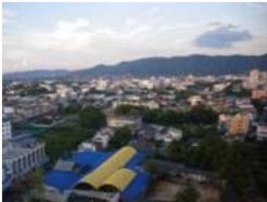
Hat Yai district, Songkhla