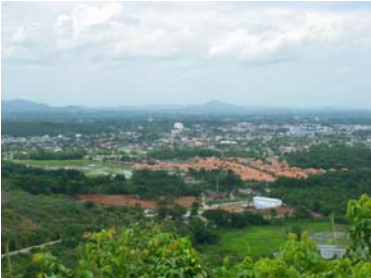
Muang district, Chiang Rai

สถาบันสิ่งแวดล้อมไทย Thailand Environment Institute