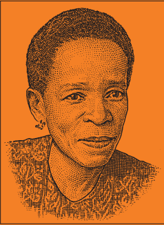
Undersecretary- General and Executive Director, UN-HABITAT; plenary speaker

my job with the united nations is to advocate for the urban poor across the world — a group growing rapidly in number, but still marginal for policy makers. Although to be poor in the countryside is hard, at least life can be lived there despite the difficulty. But to be poor in such growing Global South cities as Nairobi and Cape Town is to lose one's dignity as well.