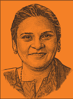
Co-founder, SPARC (the Society for Promotion of Area Resource Centres), Mumbai, India

poverty, climate change, and urbanization are the most crucial issues for this century. This triad was brought together at the Rockefeller Foundation Global Urban Summit in 2007. For representatives from Slum/Shack Dwellers International (SDI) who attended the Summit, some very important lessons emerged for moving forward. First, there is huge potential in disparate groups of people interested in a particular set of issues meeting as equals in a neutral environment to explore possibilities — learning to understand each other’s points of view with patience and examining new ways to address old unsolved problems. Second, we must recognize the power of local and global connectivity to turn a vertical hierarchical structure into a circle; today, global and local entities are so closely linked that they are both critical to developing scalable solutions. Third, with much of this century’s development drama taking place in urban areas, we must build new skill sets to engage each other to transform what appears to be crises into potential opportunities.